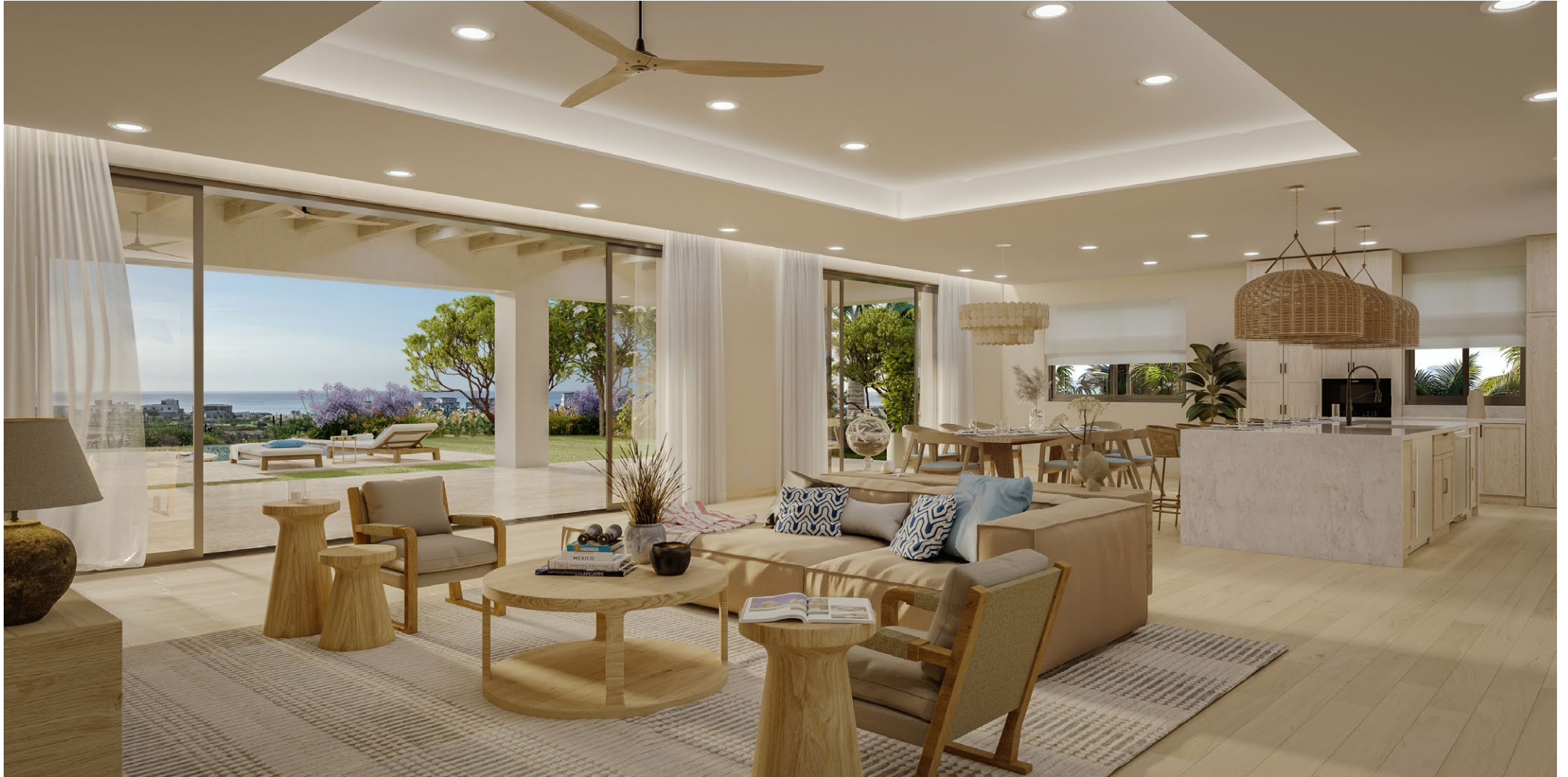
Artistic representation/conceptual rendering of a Crest home.