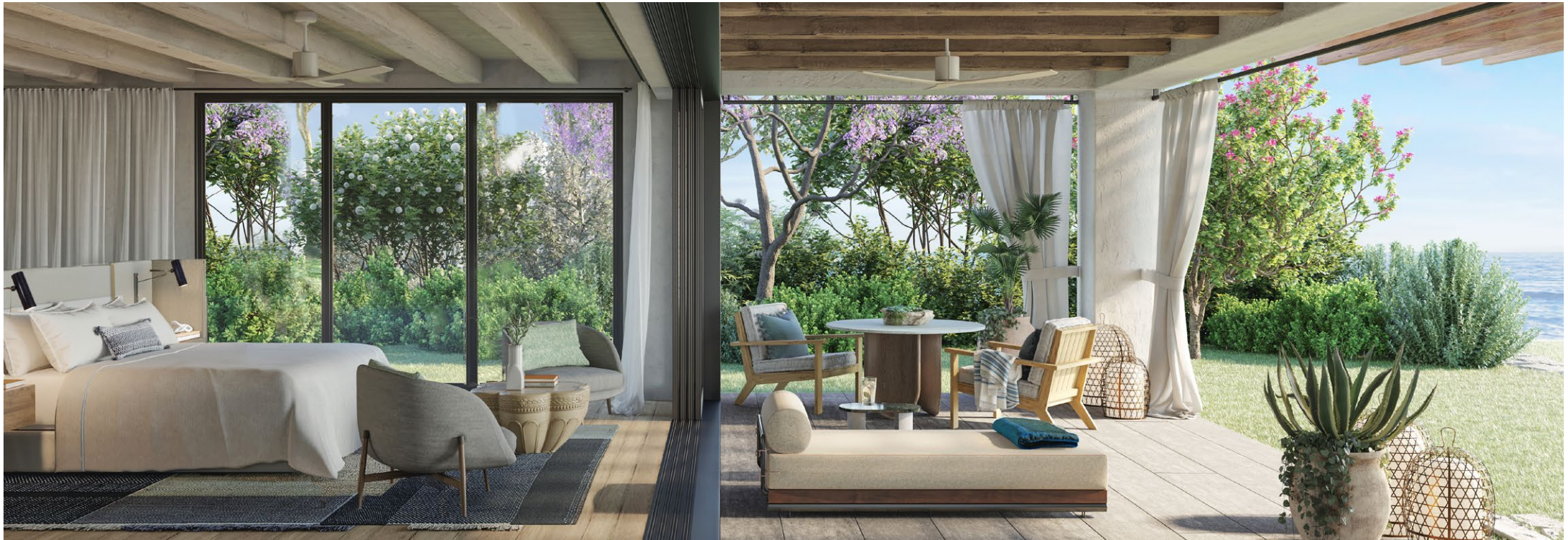
Artist Representation of Four Bedroom Private Villa Garden Level Master Bedroom

These villas offer unique designs and blend elements of traditional Mexican architecture with contemporary touches and luxuries. The four-bedroom floor plan includes inviting outdoor showers and a lock-off unit for maximum privacy and flexibility. The airy and open rooms flow seamlessly onto a private terrace with an expansive pool deck leading to an infinity edge swimming pool and spa to provide the focal point for this refined outdoor living.