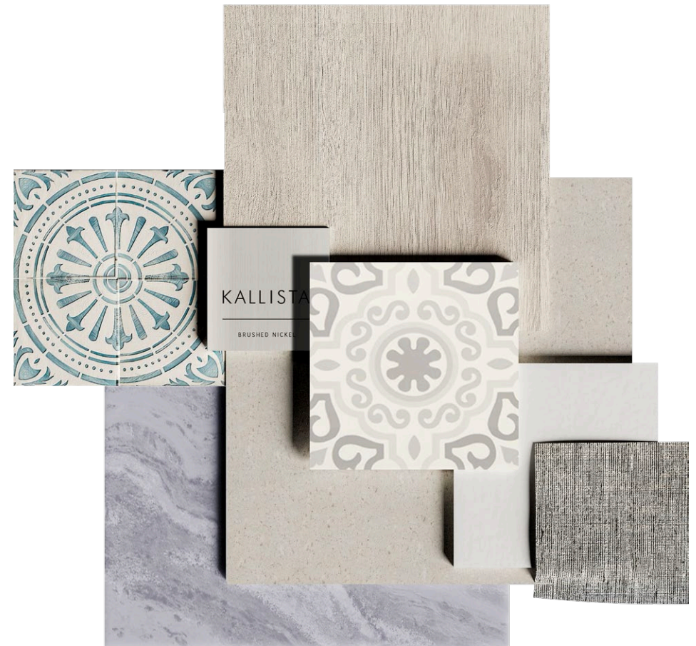
Artist Concept Rendering illustrating interior finish materials palette