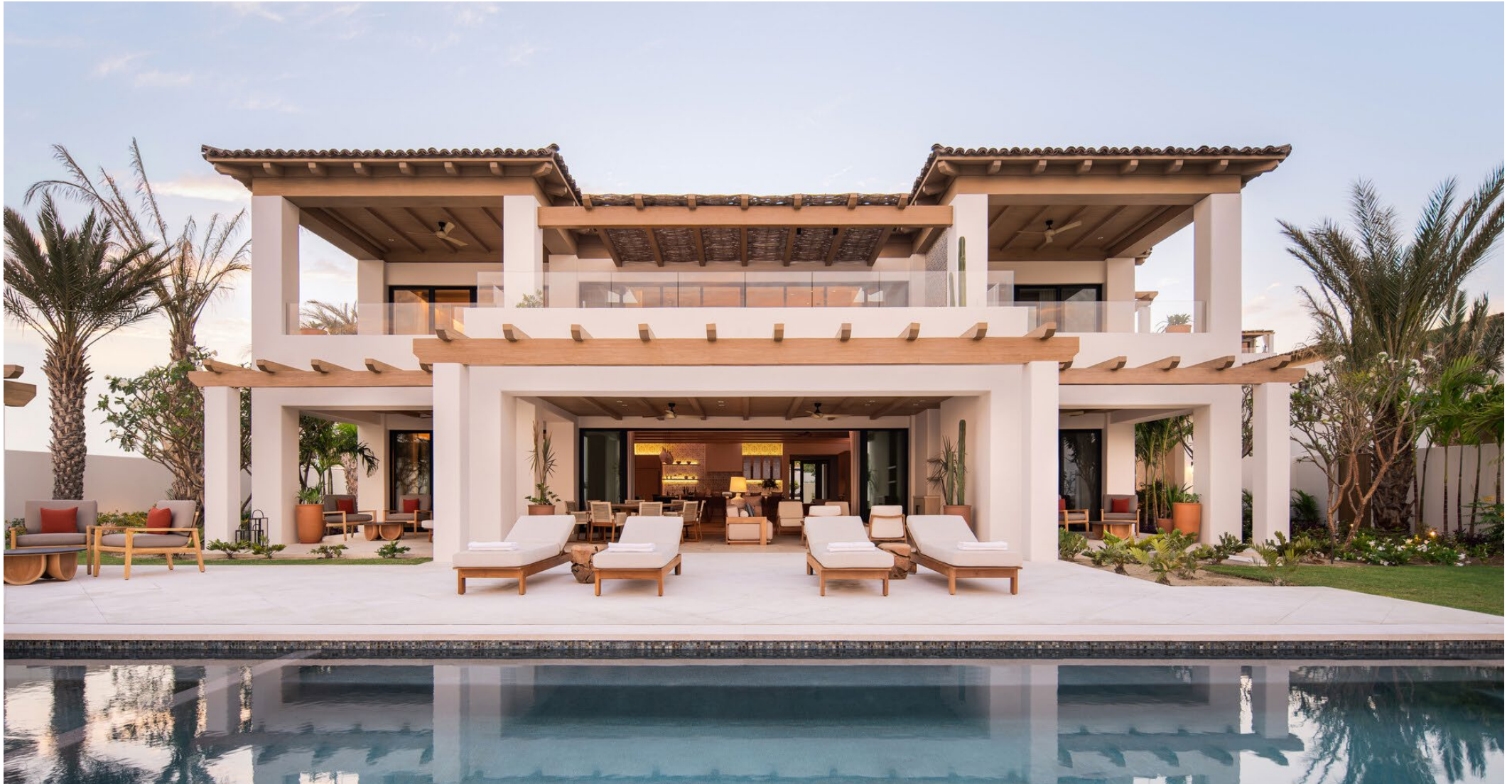
Four Seasons Private Villa Four Bedroom Garden Level and Four Bedroom Upper with Rooftop Pool