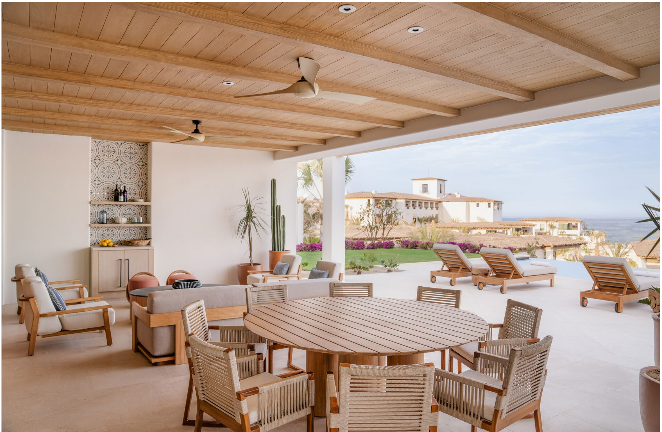
Four Bedroom Private Villa Garden Level Great Room