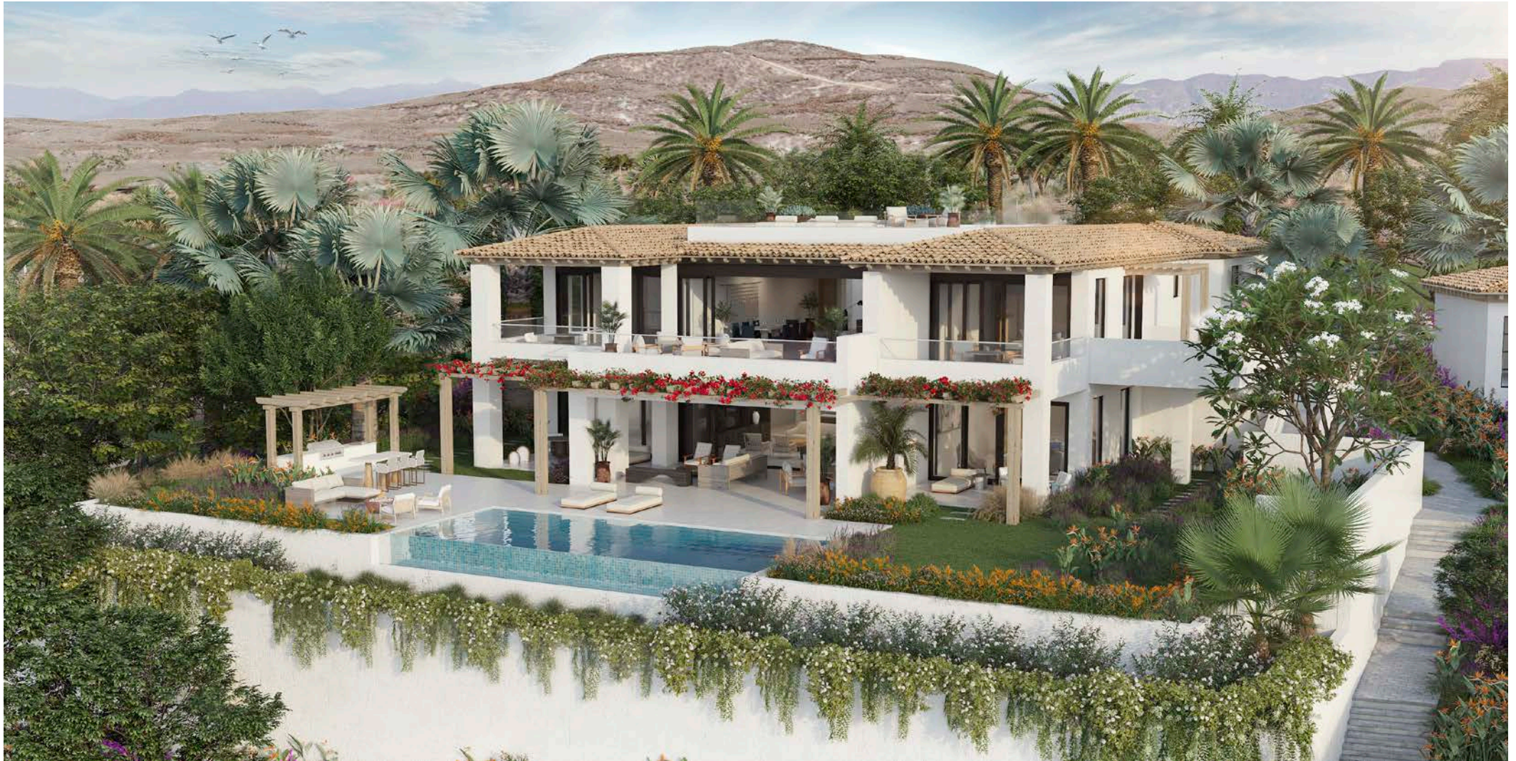
Artist Representation of Four Seasons Private Villa Four Bedroom Garden Level and Four Bedroom Upper with Rooftop Pool