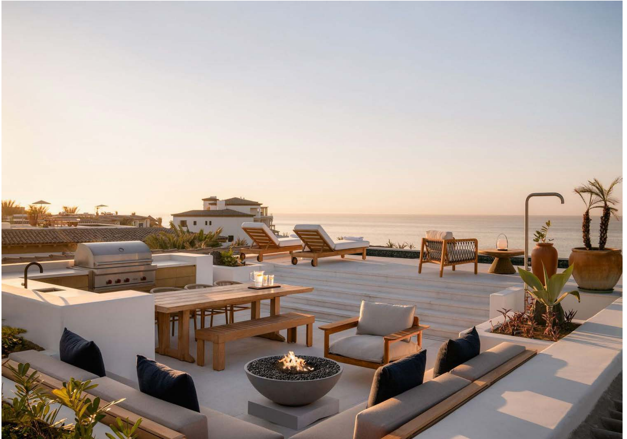
Casa 11 Private Villa Upper Level Rooftop Entertainment Deck and Pool with Standard Furniture