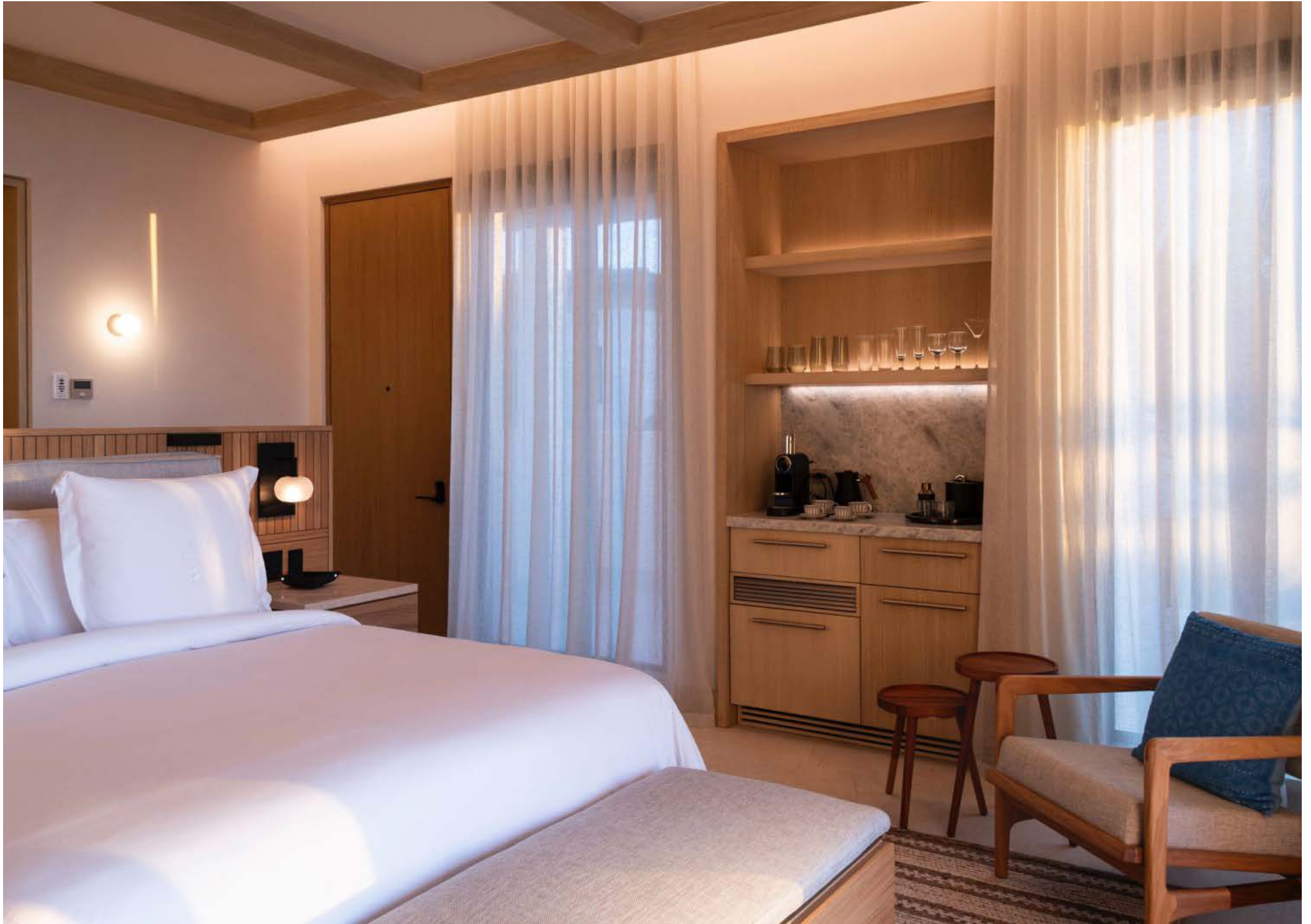
Casa 11 Four Seasons Private Villa Upper Level Primary Bedroom with Custom Furniture