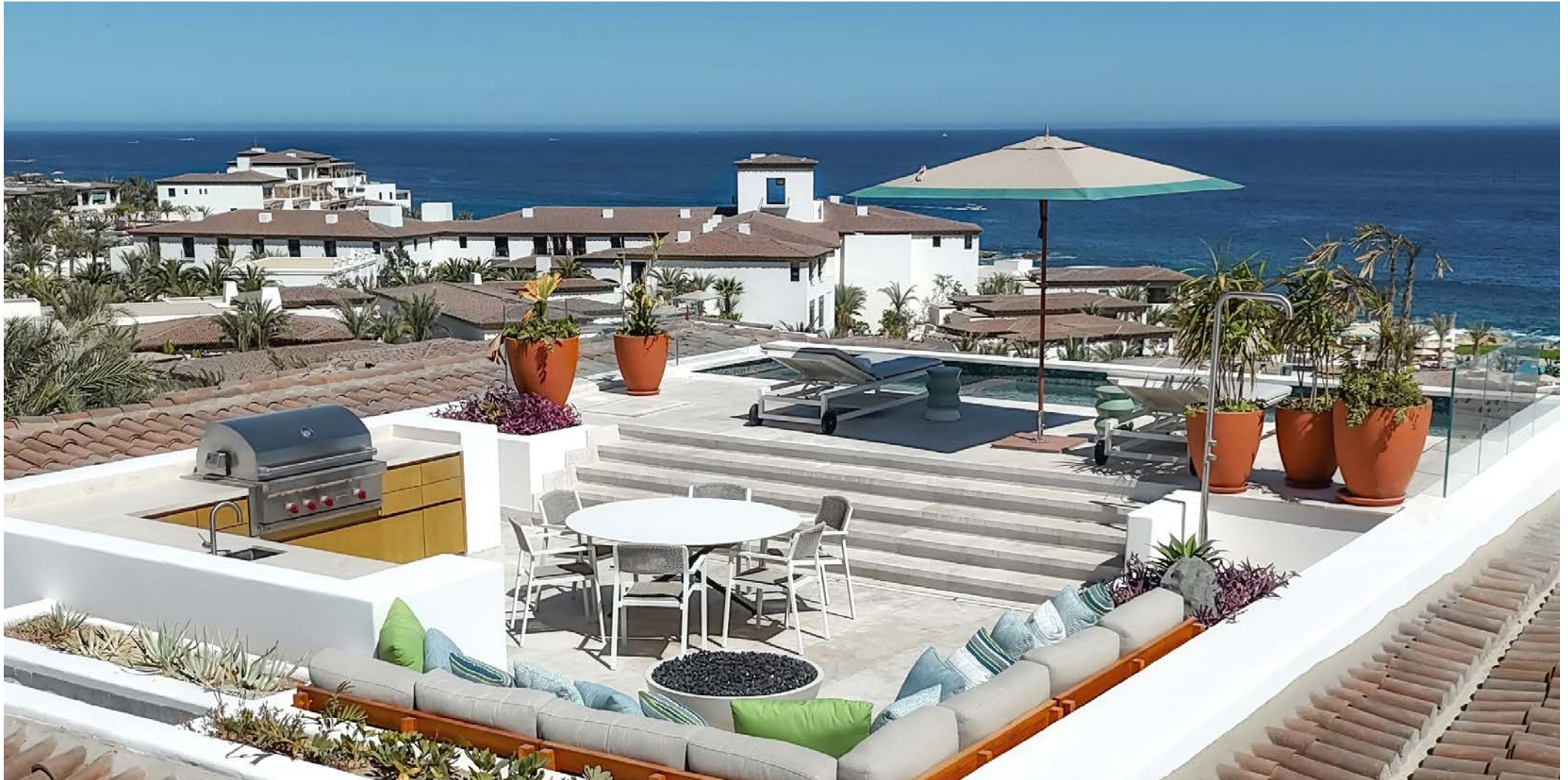
Casa 11 Private Villa Upper Level Rooftop Entertainment Deck and Pool