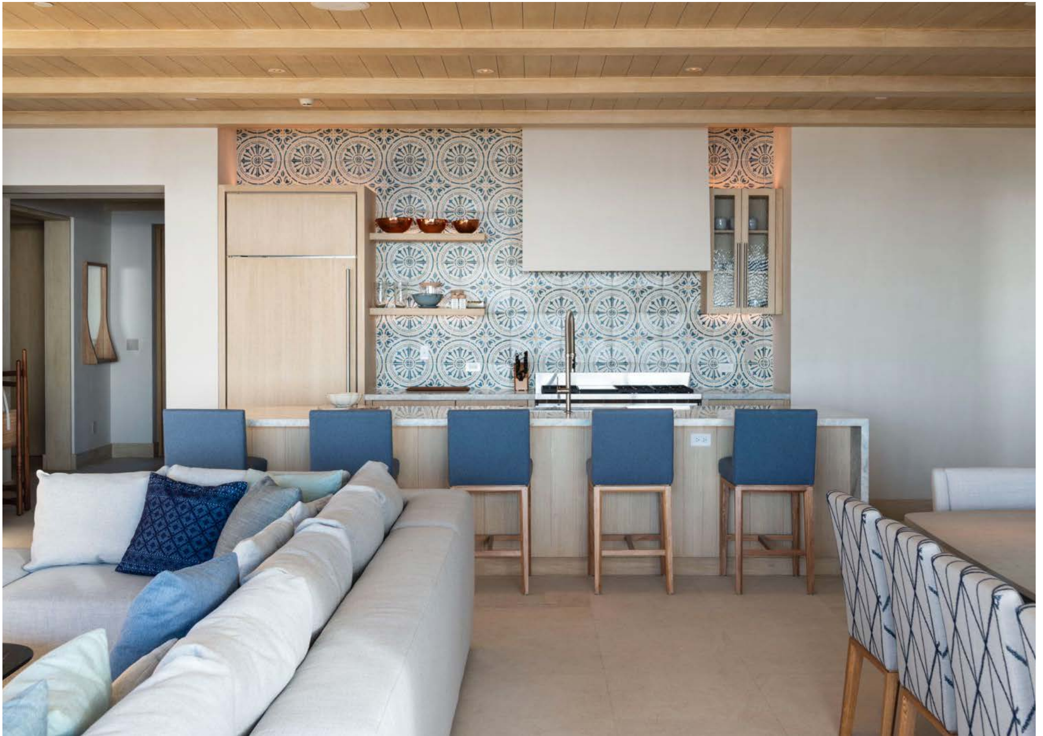
Casa 11 Four Seasons Private Villa Upper Level with Custom Furniture