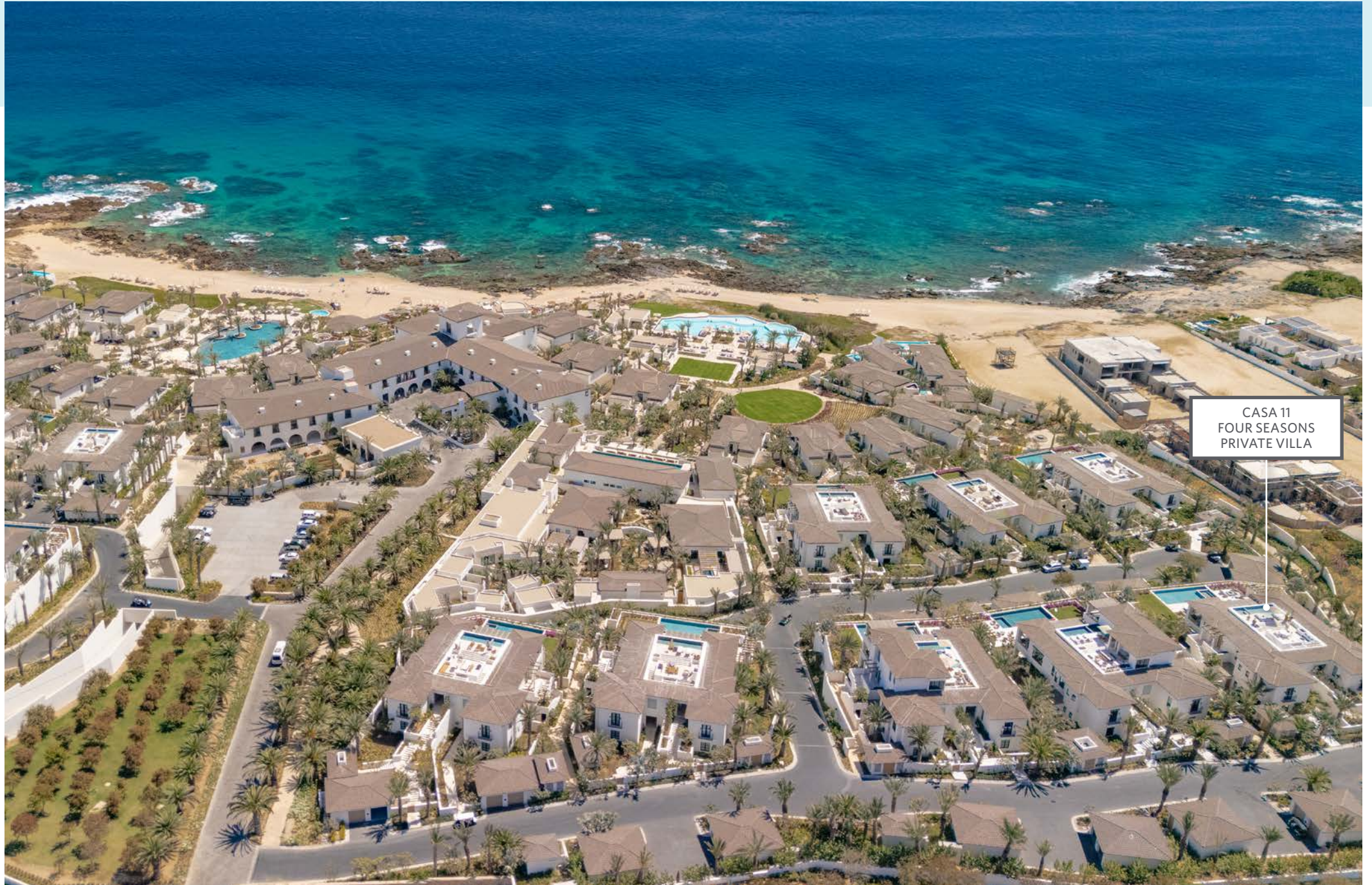
Four Seasons Cabo San Lucas at Cabo Del Sol