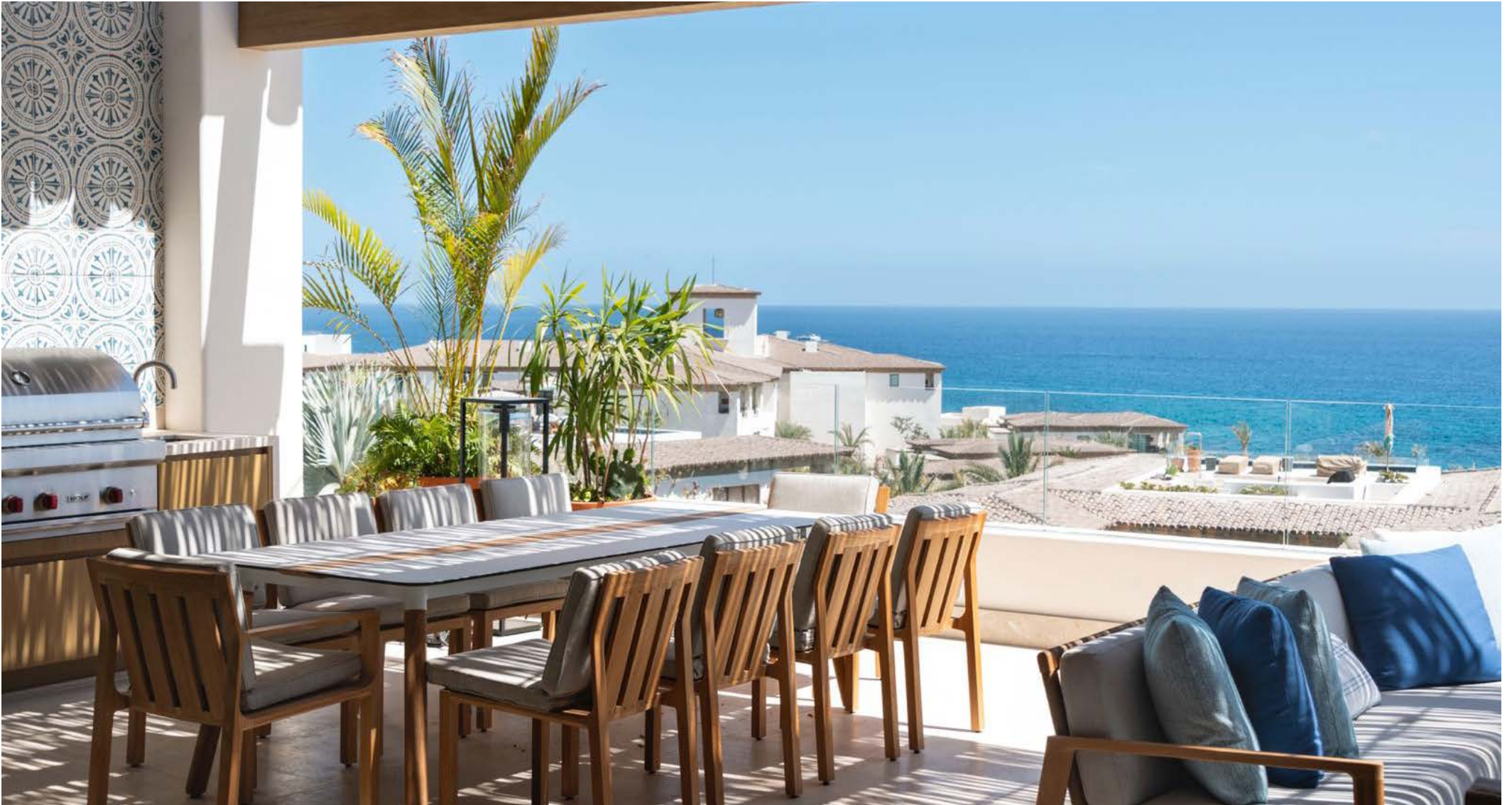
Casa 11 Four Seasons Private Villa Upper Level Terrace

These villas offer beautifully detailed indoor/outdoor living space and are sited to take full advantage of the Sea of Cortez views, the rhythmic sound of the gentle surf and the cool ocean breezes. The unique designs blend elements of traditional Mexican architecture with contemporary touches and luxuries. The four-bedroom floor plan includes a lock-off unit for maximum privacy. The spacious, open rooms seamlessly transition through expansive windows to private terraces, featuring a stunning rooftop pool and spa.