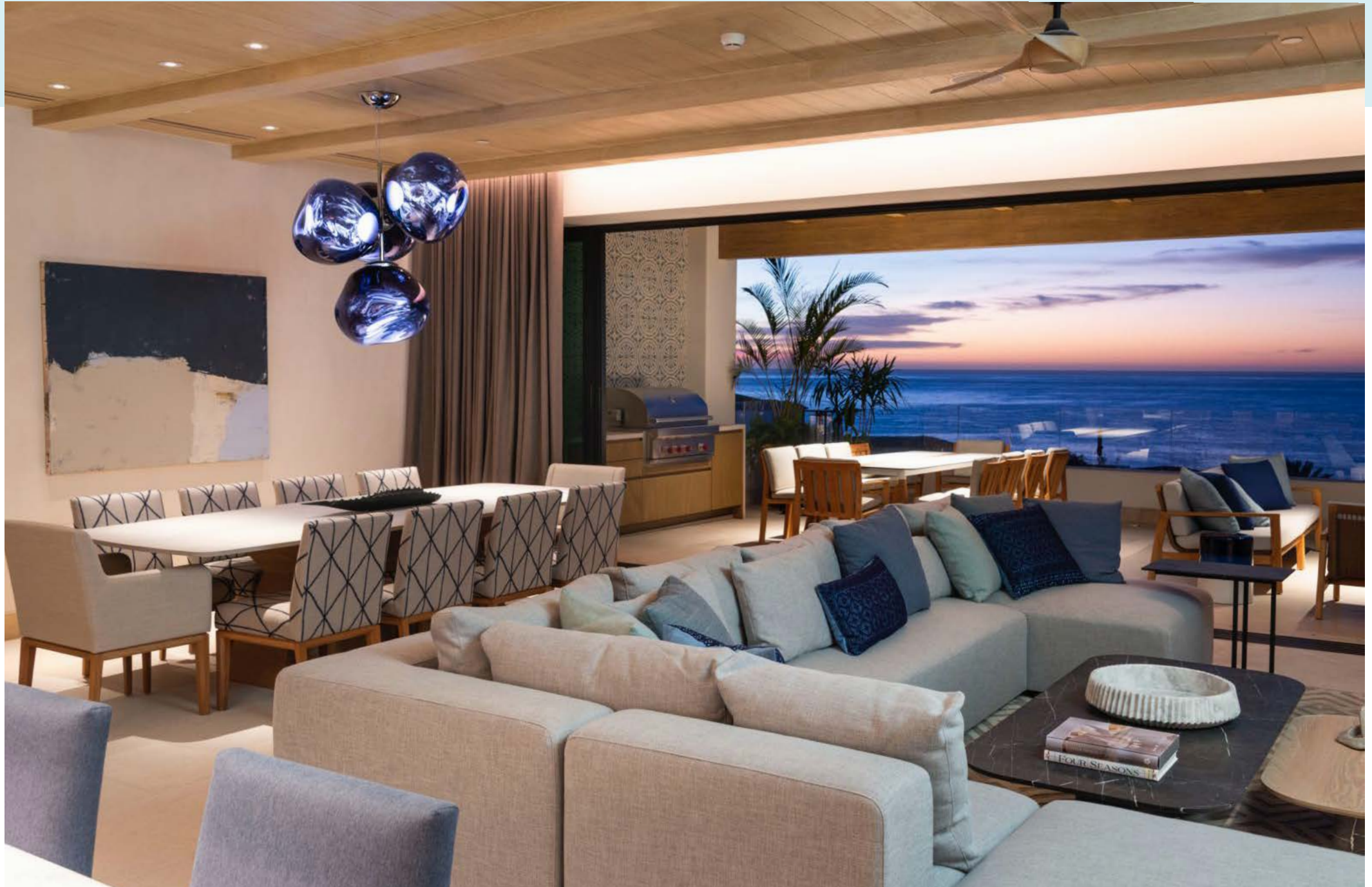
Sunrise View from Casa 11 Four Seasons Private Villa Upper Level