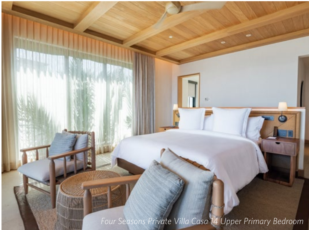
Four Seasons Private Villa Casa 14 Upper Primary Bedroom