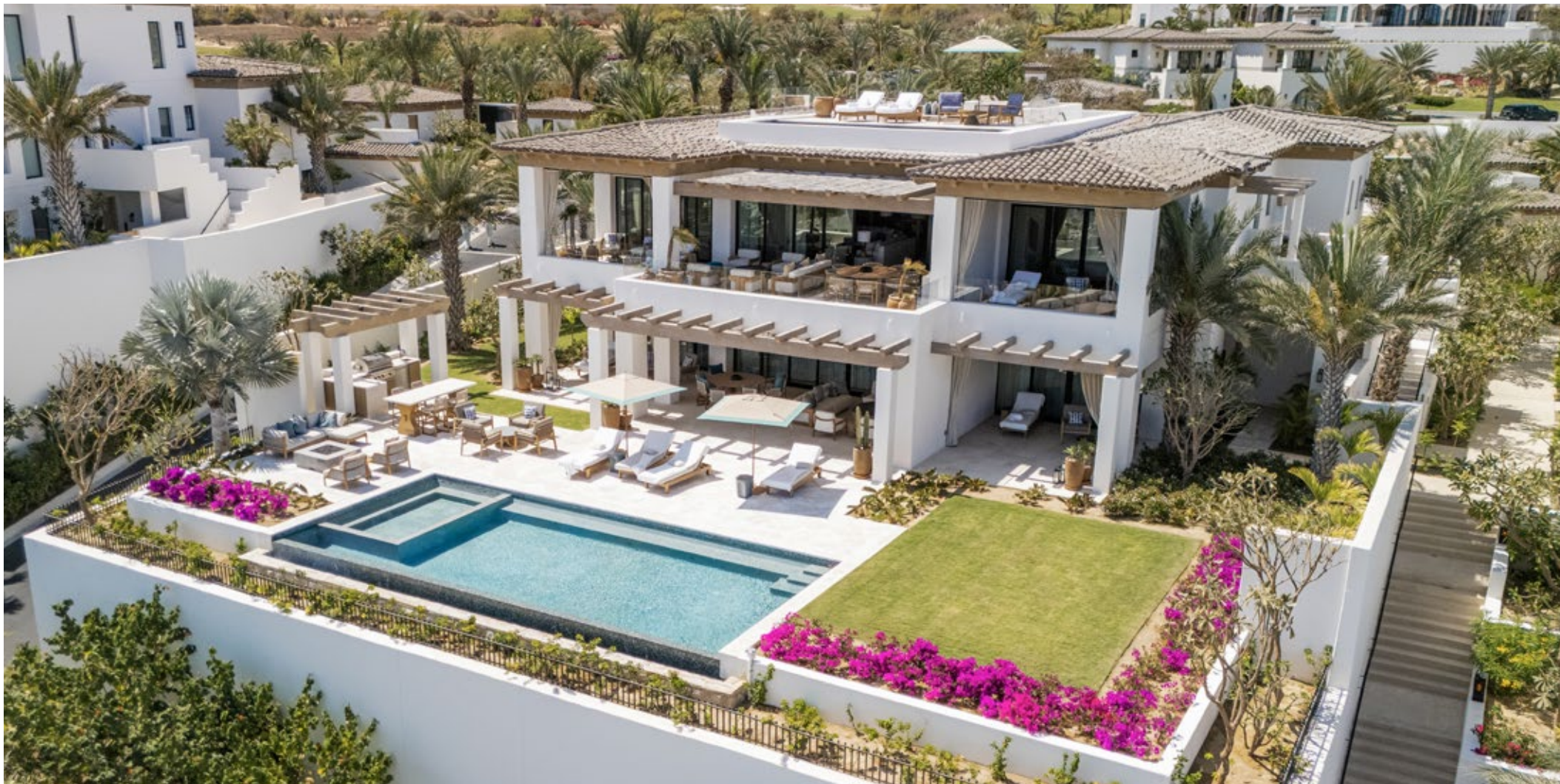
Private Villa Four Bedroom Garden Level and Four Bedroom Upper with Rooftop Pool