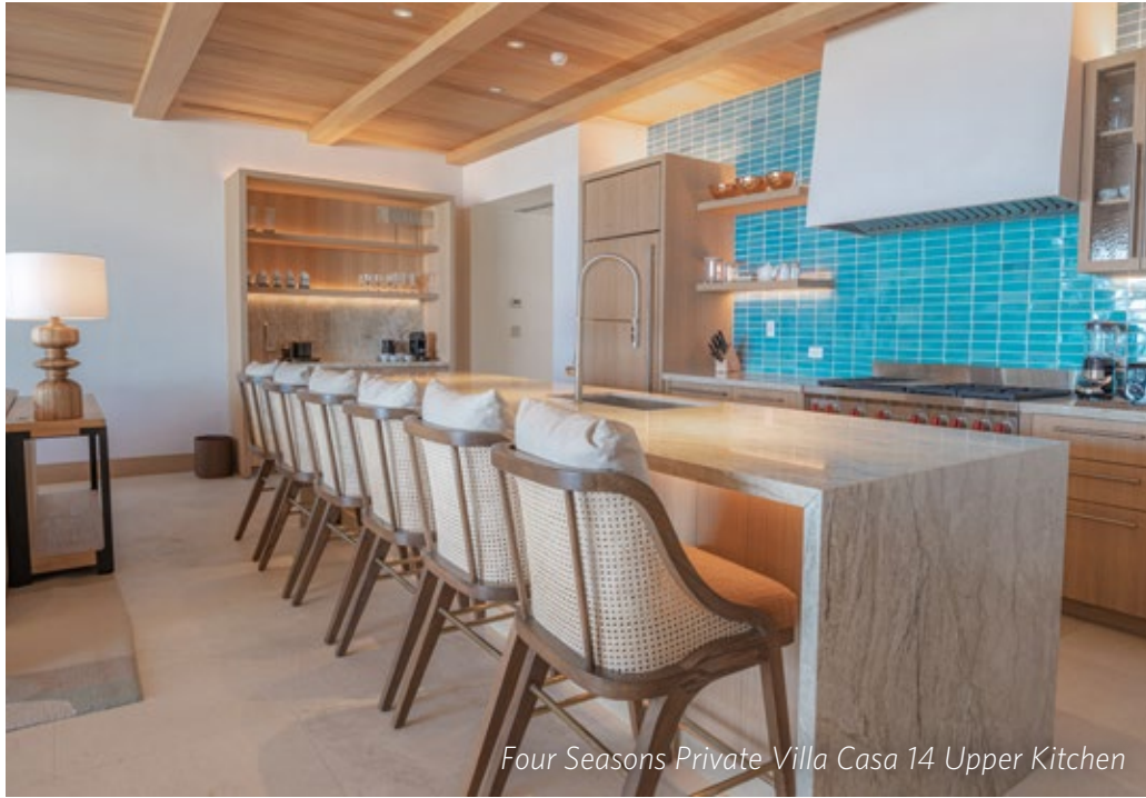
Four Seasons Private Villa Casa 14 Upper Kitchen