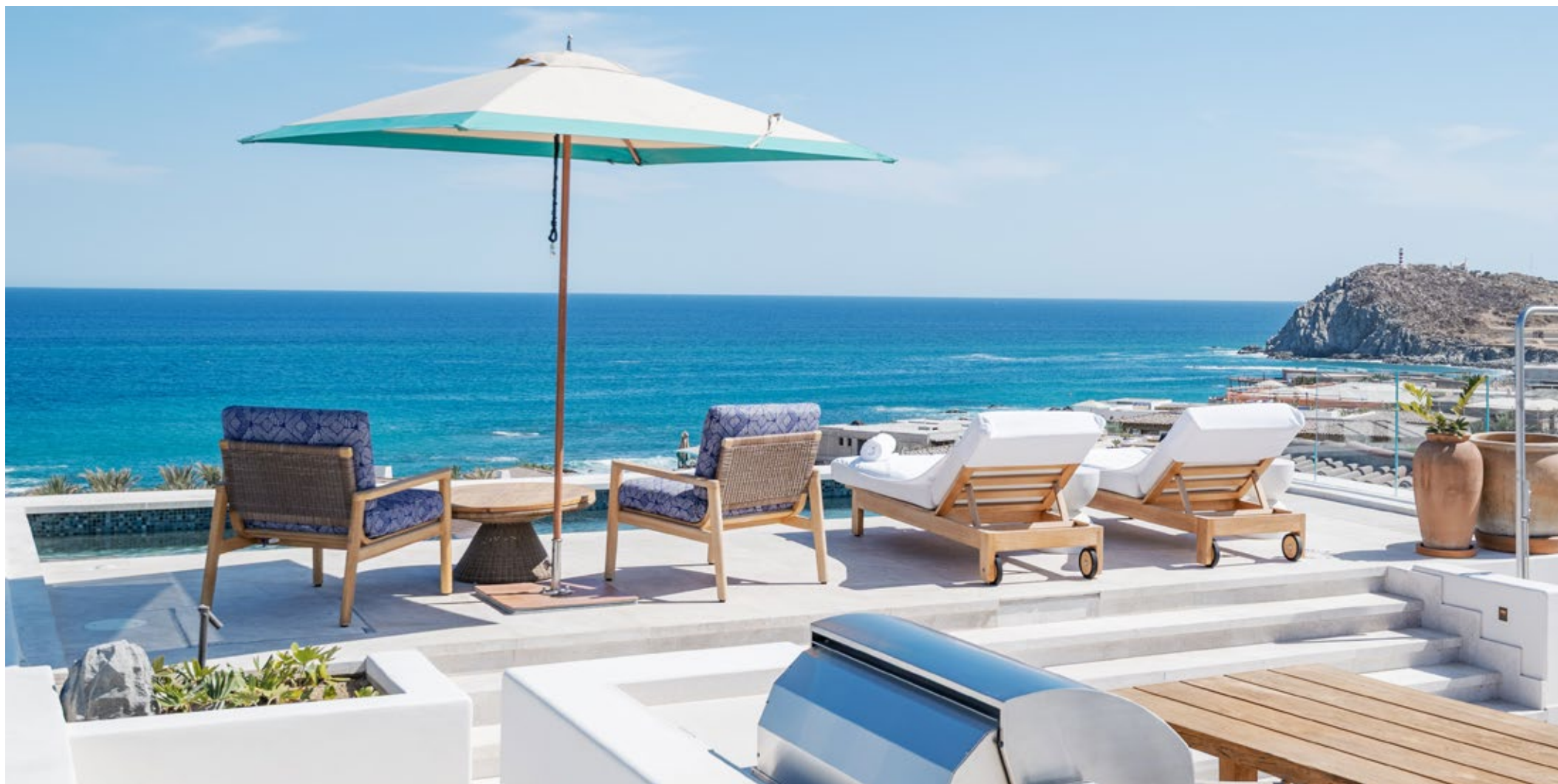
Private Villa Four Bedroom Rooftop Entertainment Deck and Pool

These villas offer beautifully detailed indoor/outdoor living spaces and are sited to take full advantage of the Sea of Cortez views, the rhythmic sound of the gentle surf and the cool ocean breezes. The unique design blend elements of traditional Mexican architecture with contemporary touches and luxuries. The four-bedroom floor plan includes a lock-off unit for maximum privacy. The spacious, open rooms seamlessly transition through expansive windows to private terraces, featuring a stunning rooftop pool and spa.