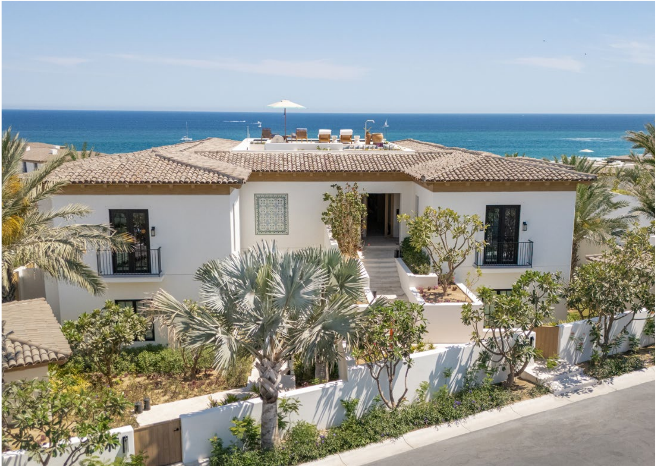
Private Villa Four Bedroom Entryway