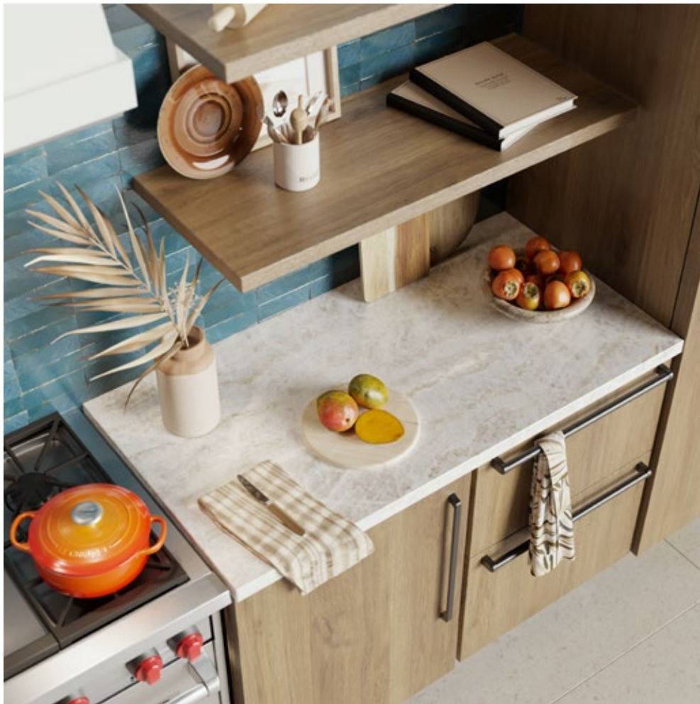
Artist Concept Rendering illustrating interior finish materials palette

The Vibrant Sun interior finish palette at Four Seasons Resort and Residences Cabo San Lucas at Cabo Del Sol, offers a warm, vibrant feel with transitional architectural elements that root the palette in the neutral backdrop of the Baja landscape. The palette draws from Mexico's rich history of colors and textures. Traditional materials and textiles are redefined through current techniques, creating a new expression of the local heritage. Throughout the residence, nature is celebrated in organic shapes, hand-scraped wood, and wrought iron.