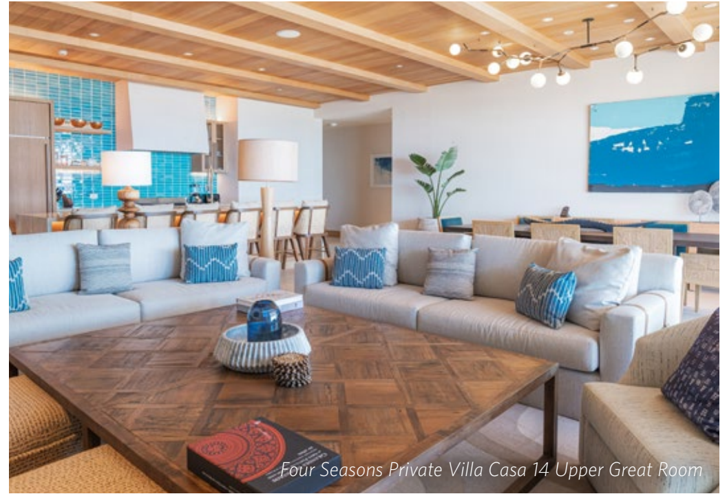
Four Seasons Private Villa Casa 14 Upper Great Room