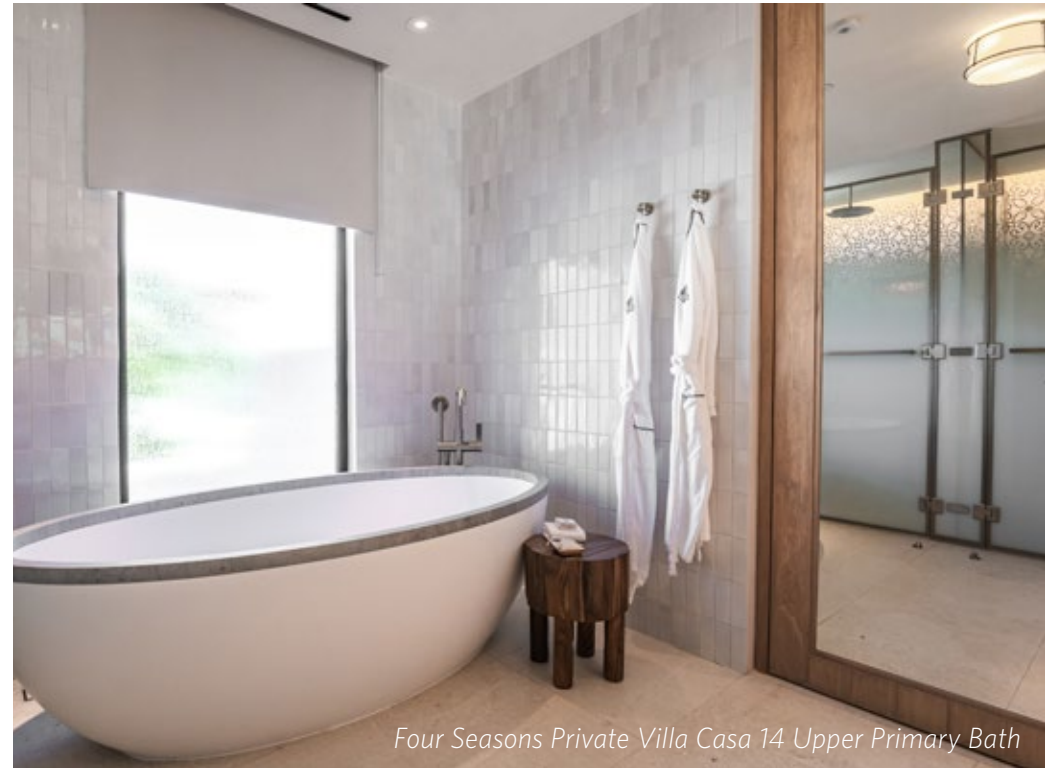
Four Seasons Private Villa Casa 14 Upper Primary Bath