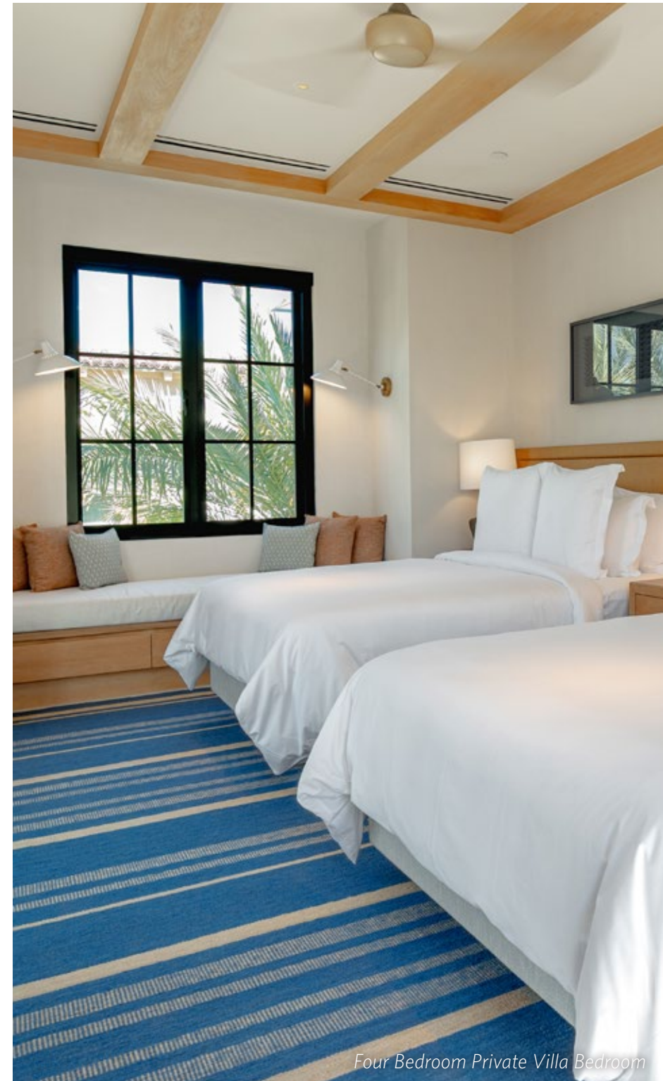
Four Bedroom Private Villa Bedroom