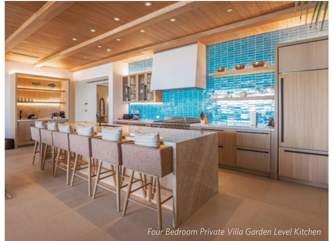
Four Bedroom Private Villa Garden Level Kitchen