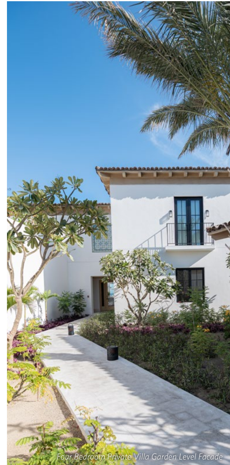
Four Bedroom Private Villa Garden Level Facade