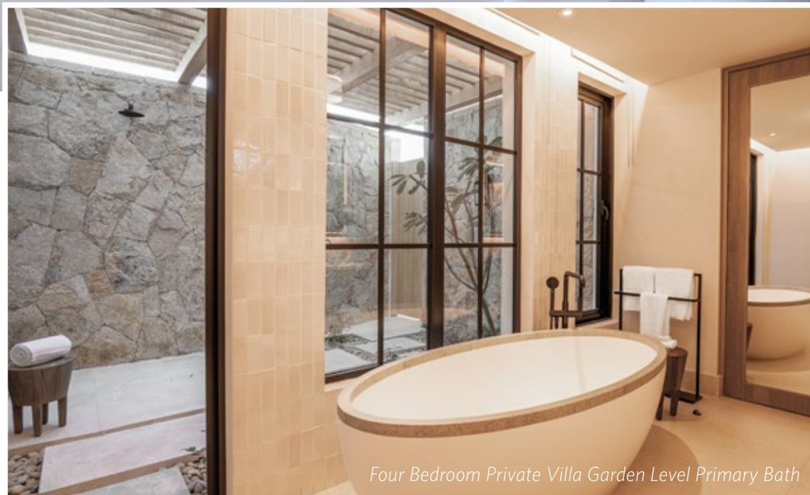
Four Bedroom Private Villa Garden Level Primary Bath

These villas offer unique designs and blend elements of traditional Mexican architecture with contemporary touches and luxuries. The four-bedroom floor plan includes inviting outdoor showers and a lock-off unit for maximum privacy and flexibility. The airy and open rooms connect to a private terrace with an expansive pool deck leading to an infinity edge swimming pool and spa, providing the focal point for this refined outdoor living.