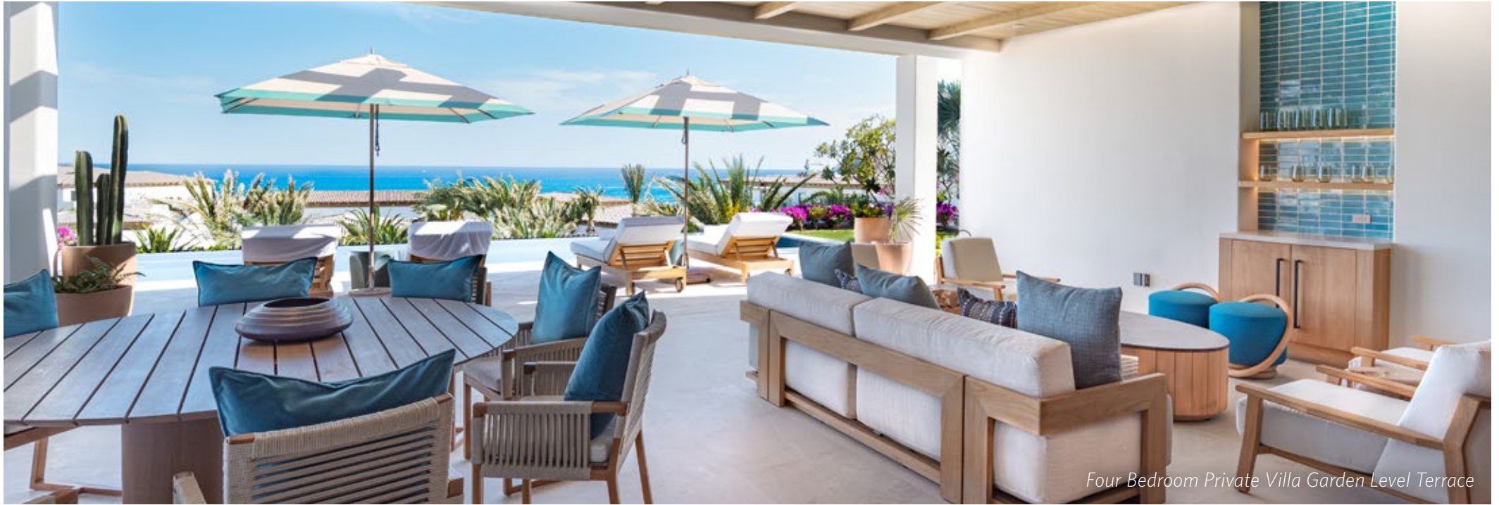
Four Bedroom Private Villa Garden Level Terrace