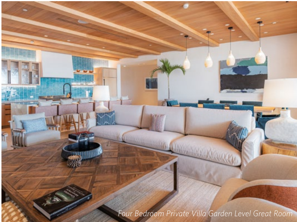
Four Bedroom Private Villa Garden Level Great Room