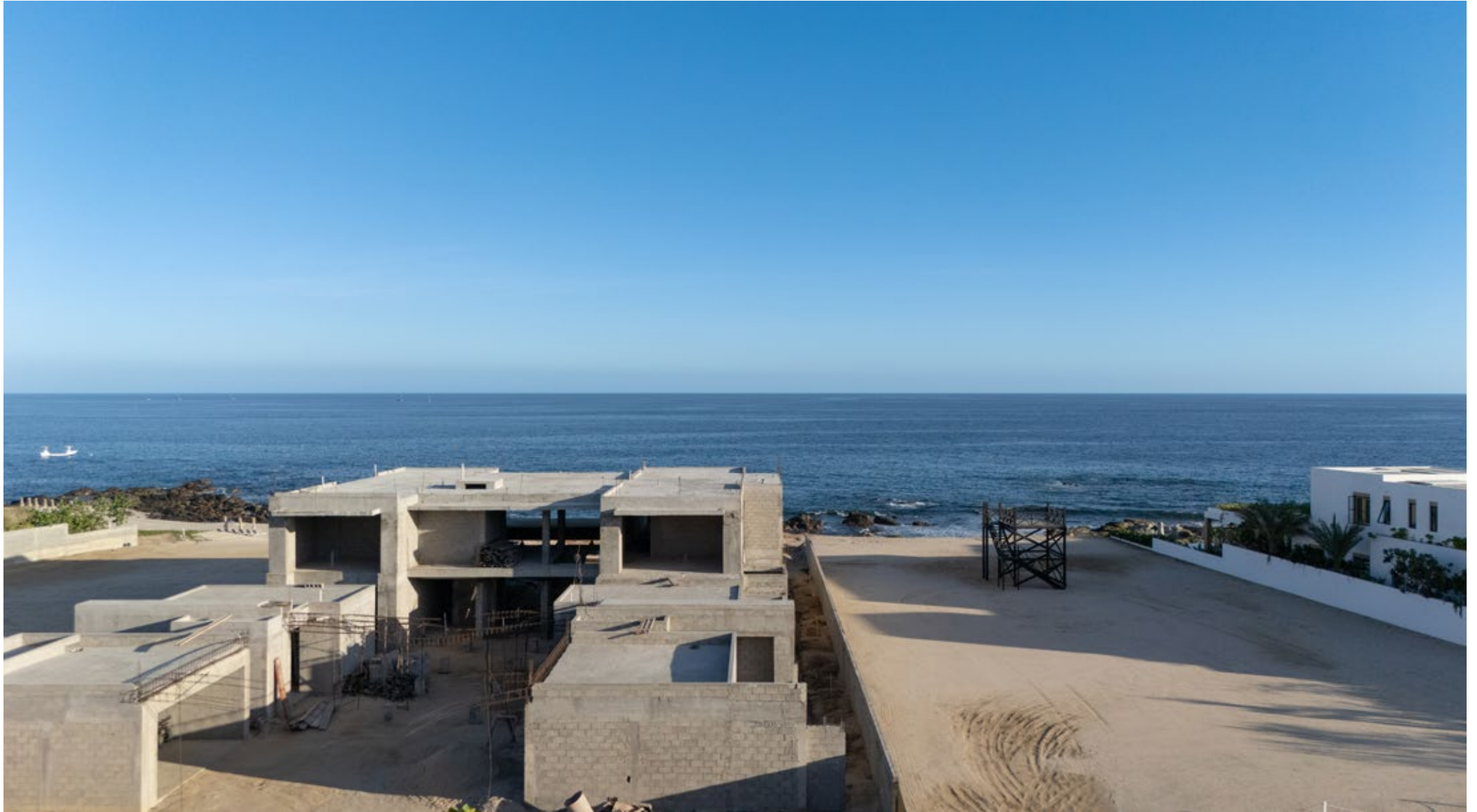
View from Upper Level