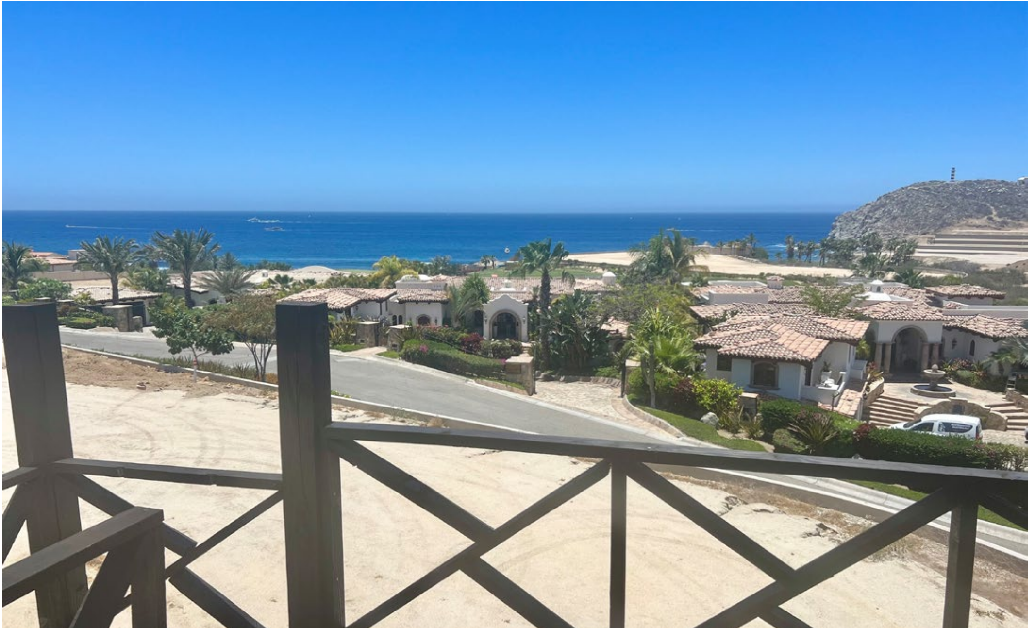
View from Upper Level